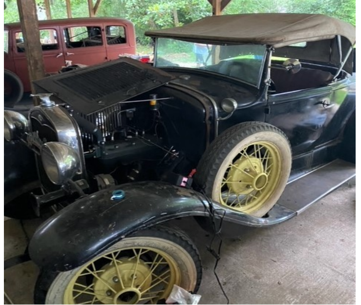
1932 Model A Roadster. Asking $15,000.00