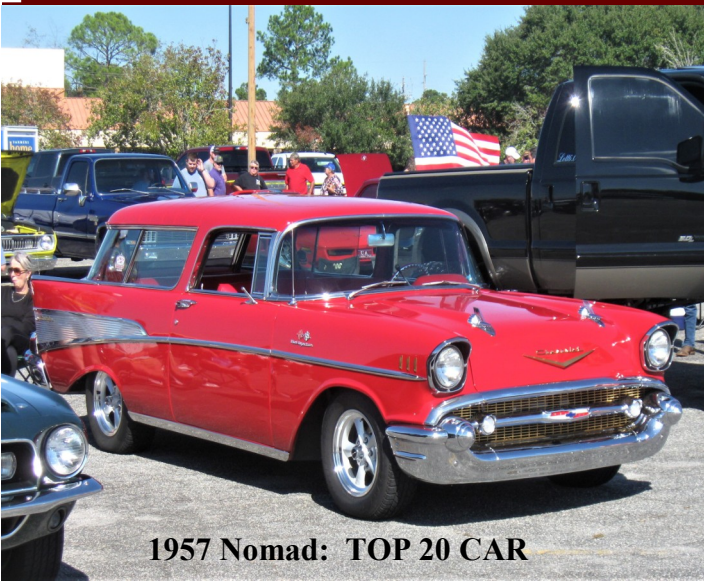
1957 Nomad: TOP 20 CAR