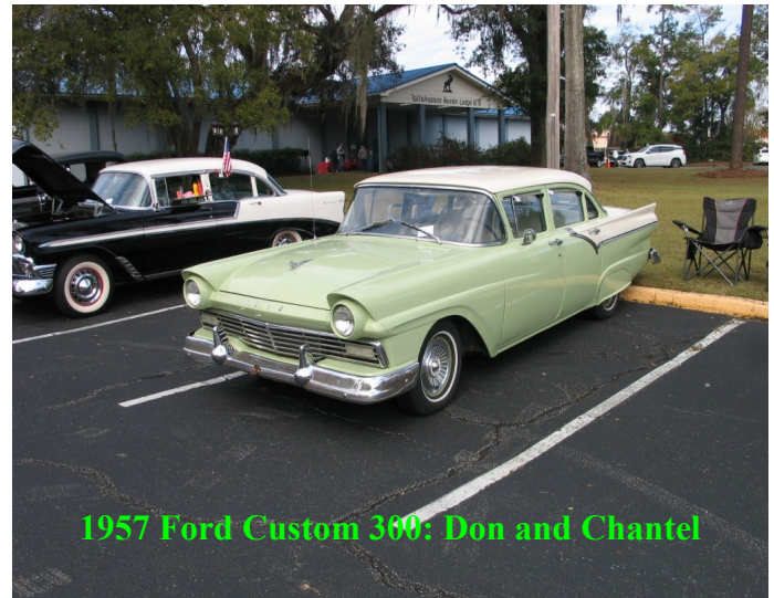
1957 Ford Custom 360: Don and Chantel