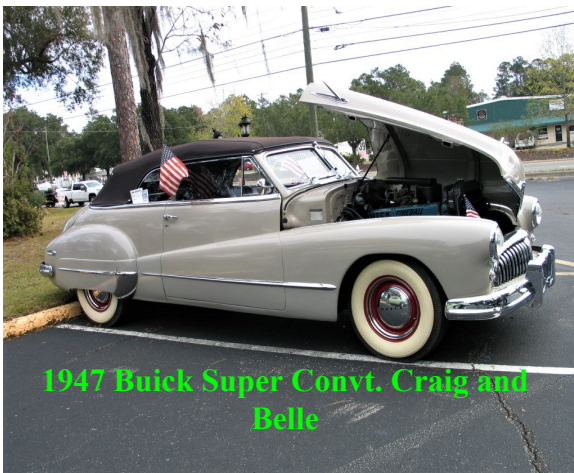
1947 Buick Super Conv. Craig and Belle