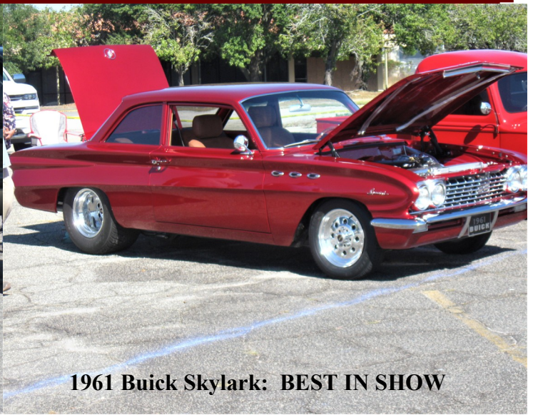
1961 Buick Skylark: BEST IN SHOW